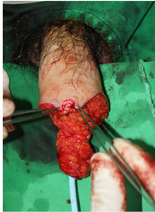
Figure 3 The status of the unresected and isolated neourethra after the penile tissue resection.