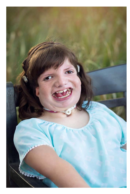
Photograph of patient 19 at age 10 years. She had facial features in keeping with TCS, including downslanted palpebral fissures, strabismus, bitemporal narrowing, external ear abnormalities, cleft palate, and prominent micrognathia.

The vast majority exhibited thinning of the corpus callosum (21/22, 95%) and cerebellar atrophy (19/22, 86%), often mild. Posterior white matter atrophy was present in 7/22 cases (32%). Diffuse supratentorial atrophy was also seen in 6/22 participants (27%), without clear correlation with age or clinical severity.