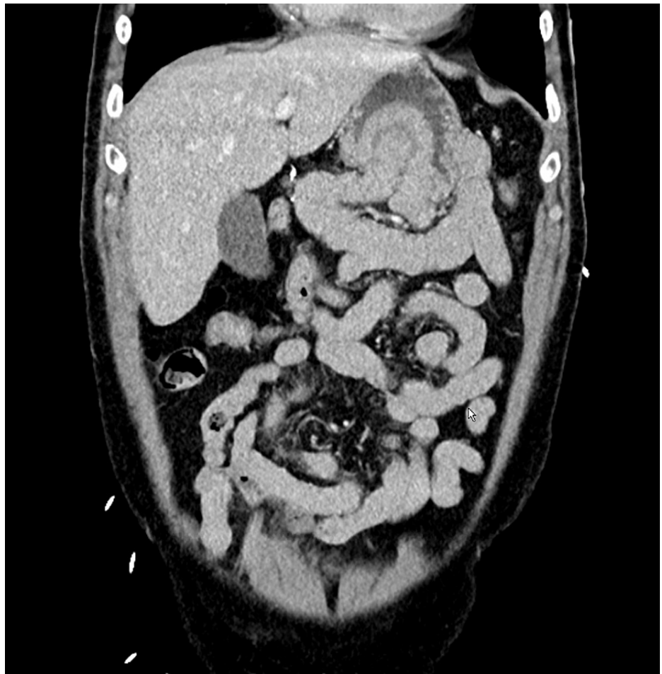
FIGURE 1: Frontal view of gastric intussusception