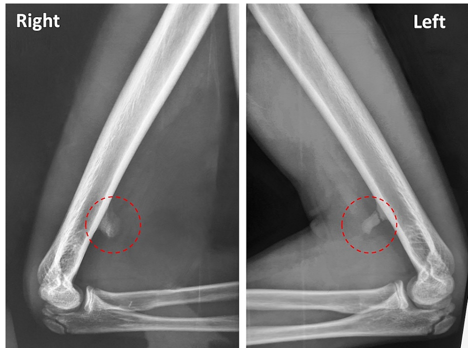
FIGURE 1: Bilateral elbow radiographs demonstrated the supracondylar process at the anterior side of the distal humerus.

A radiolucent line was evident in the base of the left bone spur that indicated a stress fracture or incomplete fusion of the supracondylar process.