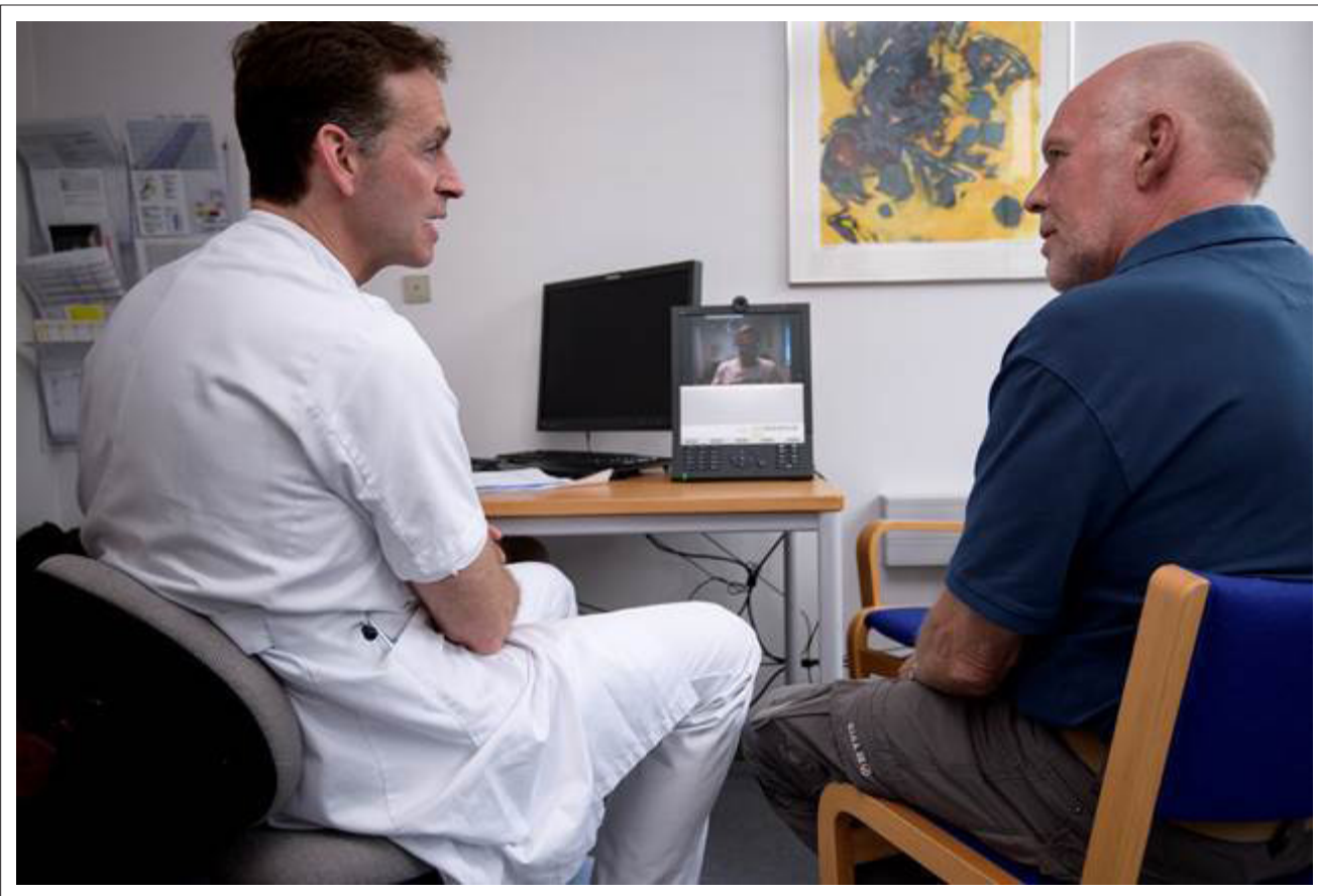
Figure 2 Picture of the video consultation with the patient at the hospital, together with the oncologist. The GP is taking part in the consultation by means of video from his clinic located in the rural region (picture-in-picture feature is turned off in this picture).

saturation point may be reached. Therefore, at this point it was decided to stop the inclusion of data. By random, it ended with a consecutive sample.