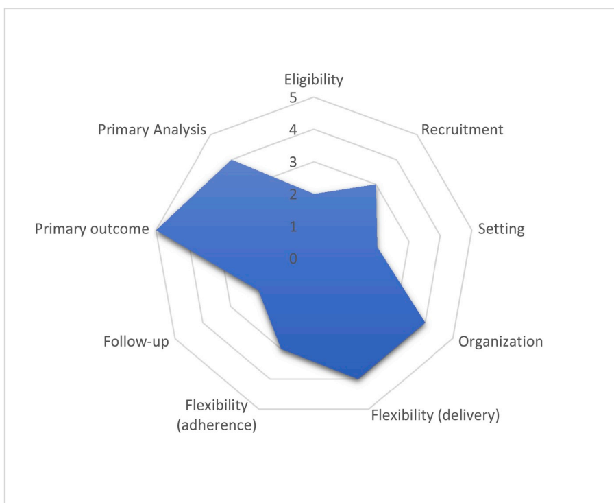
Fig. 2. PRECIS-2 wheel highlighting relatively pragmatic and explanatory features of the trial design.

Participants will be excluded from the trial if they have any major systemic illness or unstable medical condition (e.g. Parkinson’s disease, cancer) or psychiatric condition requiring immediate treatment or that could lead to difficulty complying with the protocol; history of stroke, carotid artery dissection, or vertebral artery dissection; head or neck trauma within the past year; current alcohol or substance abuse (self-reported); or diagnosis of medication overuse headache (International Classification of Headache Disorders-II) [19]. Participants will be excluded by the study neurologist if they show high risk for adverse events from cervical spine manipulation including signs of myelopathy or carotid bruits. Participants will also be excluded if they begin use of new prophylactic medication for migraine headaches within the last 3 months, are currently taking prophylactic migraine medications other