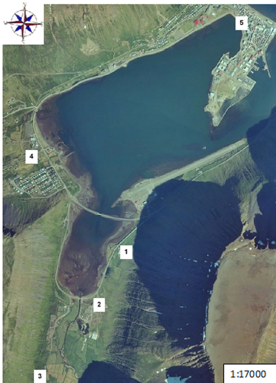
Figure 2 Aerial photograph of Skutulsfjörður. The numbers give the location of the (1) waste incinerator, (2) nearby sheep farm in Engidalur, (3) nearby dairy farm in Engidalur; and (4,5) local town of Ísafjörður.

As the dairy herd was localized at the farm and fed on hay from the valley, one additional composite milk sample and