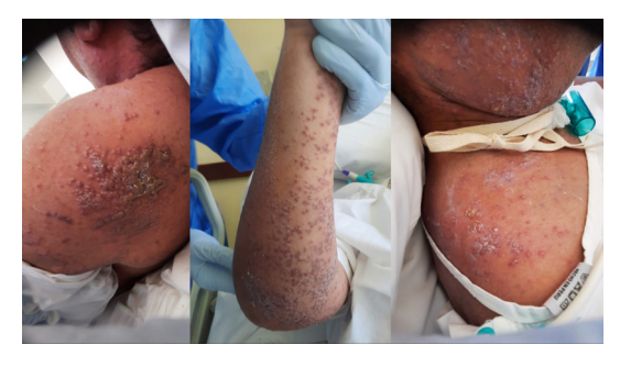
Figure 1 Cutaneous presentation in our patient with suspected drug rash with eosinophilia and systemic symptoms syndrome. Diffuse purpuric confluent morbilliform skin lesions with follicular accentuation and raised borders on shoulder and arms. Scaling areas were covering the face.

A 49-year-old man with Down syndrome and obesity was admitted to our institution with a diagnosis of COVID-19 pneumonia, confirmed by tomography and real-time PCR test for SARS-CoV-2. In less than 48 hours, the patient was intubated at the intensive care unit (ICU) due to severe acute respiratory distress syndrome. Later, he developed ventilator-associated pneumonia followed by septic shock and was started with meropenem pending culture results. Although the patient had persistent fever, there was an overall improvement in his respiratory status, so he was transferred to the medical floor. Nevertheless, under the suspicion of a bloodstream infection, meropenem was restarted and caspofungin was added as empiric treatment. Two days later, the results from blood and bronchial aspirate cultures were obtained that showed multidrug-resistant Pseudomonas aeruginosa. Given the antibiogram result, meropenem was stopped and gentamicin and colistin started. However, despite the aforementioned treatment, he continued with fever episodes; thus, greater coverage was included