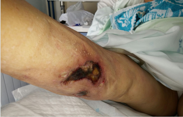
Figure 1. Lesions on admission