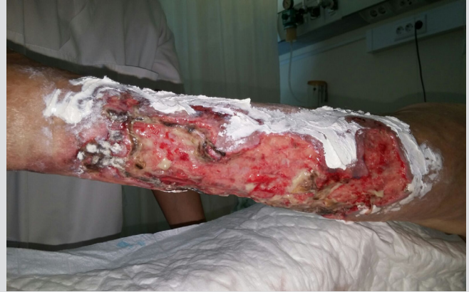
Figure 2. Lesions evolving to a large ulcer, 7 days after admission