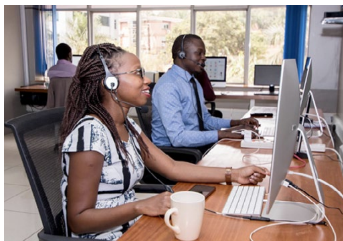
Figure 1: rocket health call center in use during COVID-19 outbreak

Mobile phone health information dissemination: health content on COVID-19 has been disseminated via mobile SMS by different telecommunication companies and partners in support of the ministry