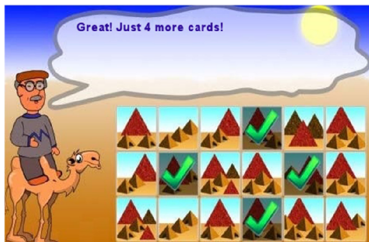
Figure 4 Demo of the Pyramid Test.

Table 3 shows data taken from the usability questionnaires completed by participants after each assessment (at baseline and post-training times) and the training session.