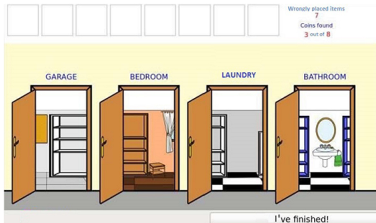
Figure 1 Searching for Objects: screen of the corridor.

Three training exercises ( Searching for Objects , Lists of Errands and Gift Purchase ) simulate the ecological tasks or surroundings such as the home, neighborhood or shopping centers where users must perform specific everyday activities. Each training exercise has four levels of difficulty and users automatically proceed to the next