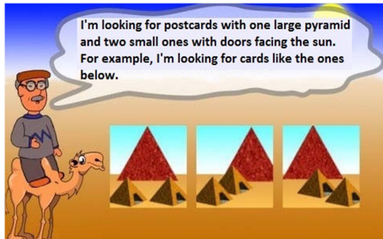
Figure 3 Instructions of the Pyramid Test.

Standardized test scores were compared with those of computerized tests using the Pearson correlation coefficient. Baseline differences between the experimental and the control group were tested with independent-sample t-tests (there were no significant differences in any variable) and the effectiveness of cognitive stimulation was tested using mixed analyses of variance (ANOVAs) 2 (Groups: experimental vs. control) * 2 (Time of evaluation: pre vs. post). All data were analyzed using the SPSS v19 statistical package [21].