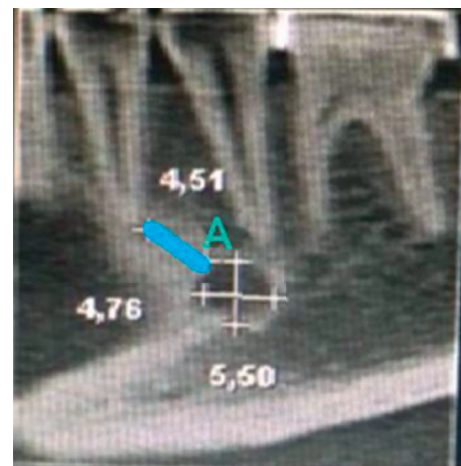
FIGURE 2: Sagittal view with measurements of the distance from the upper limit of the mental foramen (MF) to the MF apex of the first LPM.

the second LPM and the first lower molar (Position 5). Only one MF (0.6%) was located anterior to the long axis of the first LPM and in line with the long axis of the mesial root of the first lower molar (Positions 1 and 6, resp.). There was no significant difference in MF location between the sexes ( P = 0.3246 ) and age groups ( P = 0.6236 ).