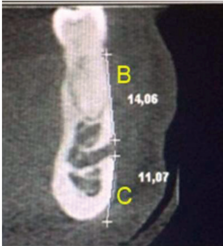
FIGURE 3: Coronal view with measurements of the mental foramen (MF) outer margin of the alveolar crest and base of the mandible.