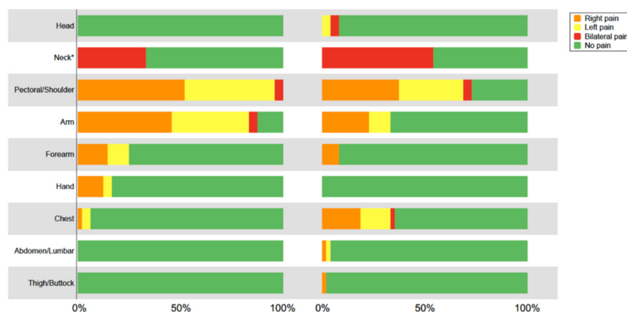
Figure 2. Pain distribution in anatomical regions reported in frontal and dorsal body charts among people with frozen shoulder contracture ( N = 48 ). * The neck region was not divided into left and right sides.

found between pain extent and shoulder disability (SPADI) ( r_s = 0.182 ), PVAQ ( r_s = -0.252 ) or pain during the last 24 h ( r_s = 0.057 ).