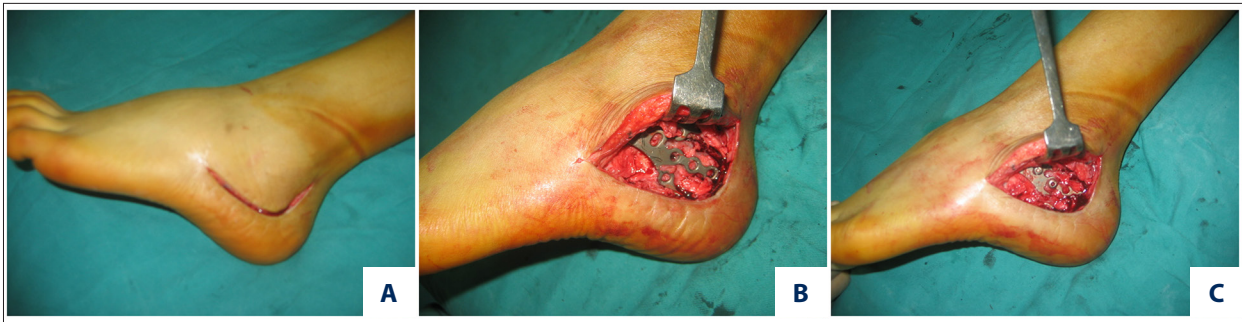
Figure 2. A 47-year-old woman had a left lateral displaced intra-articular calcaneal fracture caused by a fall from height, which was treated with the standard extended lateral approach with L-shaped incision. A curvilinear, L-shaped incision was made on the affected foot (A); a lateral plate designed for the calcaneus was used for rigid fixation (B, C).