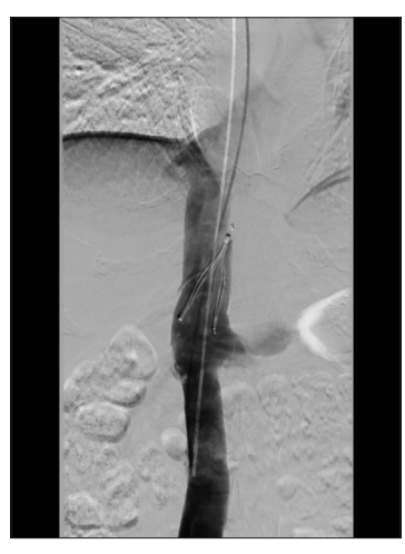
Figure 2: A 50-year-old lady presented with left lower limb deep vein thrombosis with large fibroid had inferior vena cava (IVC) filter inserted preoperatively. Retrievable Celect Platinum IVC filter was placed at the suprarenal level due to limited landing zone. Attempted IVC filter retrieval 4 weeks later failed with venogram showing marked lateral tilting of the IVC filter in supra-renal location of IVC, with the hook likely embedded in the wall of the IVC.

Attempted IVC filter retrieval 4 weeks later failed with venogram showing marked lateral tilting of the IVC filter in suprarenal location of IVC, with the hook likely embedded in the wall of the IVC, as shown in [Figure 2], retrieval failed despite multiple attempts with the IVC filter retrieval set (Cook Medical, Bloomington, Ind.). Contrast CT 9 months after filter insertion showed suspicious embedment of IVC filter hook onto the medial wall of the IVC at T11 level. Vascular surgeon's opinion was consulted with endovascular intervention explained being not possible due to high position of IVC filter and delayed removal; option of open