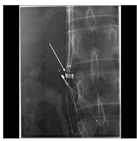
Figure 5: Another attempt a few days later also failed, same patient as in Figure 3. Loop-wire (arrow) was made with 260 cm Terumo J guidewire, 5Fr SHK catheter and 7Fr 17–30 mm EN Snare and tension was applied to try to realign the filter, but embedded filter hook by fibrous cap cannot be dissected out with double sheath technique, as shown in this fluoroscopic image.

Attempted IVC filter retrieval 3 weeks later failed despite multiple attempts with IVC filter retrieval set (Cook Medical, Bloomington, Ind.), Goose Neck Snare (Medtronic), and 7Fr 17–30 mm EN Snare (Merit Medical), attempted filter realignment was done with 12 \times 40 mm Mustang angioplasty balloon (Boston Scientific) without significant improvement, as shown in [Figure 3]. Complimentary CT showed IVC penetration by filter with embedment of filter hook and some primary struts, as shown in [Figure 4].