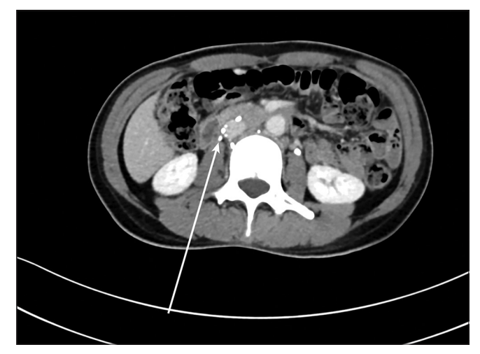
Figure 4: Complimentary computed tomography showed inferior vena cava penetration by filter with embedment of filter hook and some primary struts (arrow), same patient as in Figure 3.