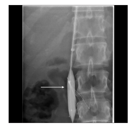
Figure 3: A 42-year-old lady presented with left lower limb deep vein thrombosis with large fibroid had retrievable Celect Platinum inferior vena cava (IVC) filter inserted preoperatively. Attempted IVC filter retrieval with filter re-alignment done using 12 \times 40 mm Mustang angioplasty balloon (arrow) which showed no significant improvement and retrieval was failed.

A 42-year-old lady presented with the left lower limb DVT with large fibroid planning for total laparoscopic abdominal hysterectomy had retrievable Celect Platinum IVC filter (Cook Medical, Bloomington, Ind.) inserted preoperatively.