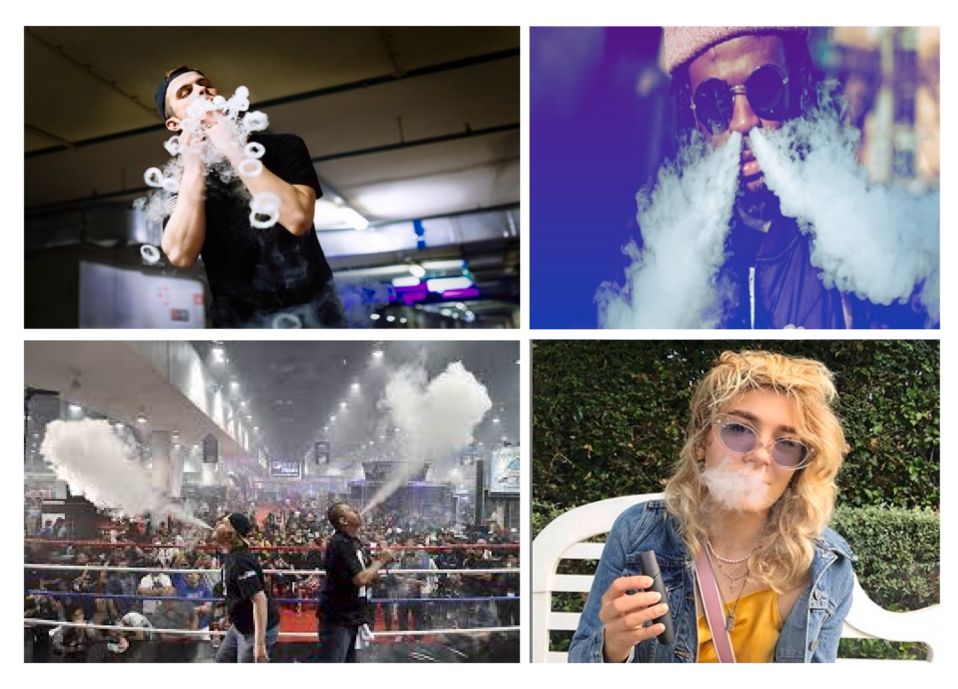
Fig. 1. Examples of e-cigarette "cloud chasing" or vape tricks from the internet, social media, and vaping convention competitions.