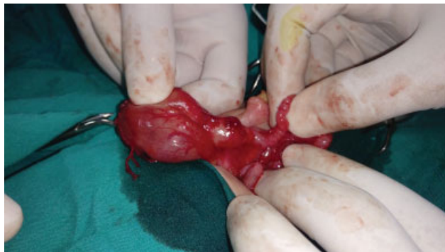
Fig. 2 Intraoperative double duodenal atresia with duodenal cyst in between.

ray showed a hugely distended stomach with a faint double bubble sign and absent gas distribution in the remaining abdomen as shown in Fig. 1 . Also, plain X-ray (PXR) chest revealed patches of consolidation and areas of hyperinflation that raised the suspicion of meconium aspiration pneumonia.