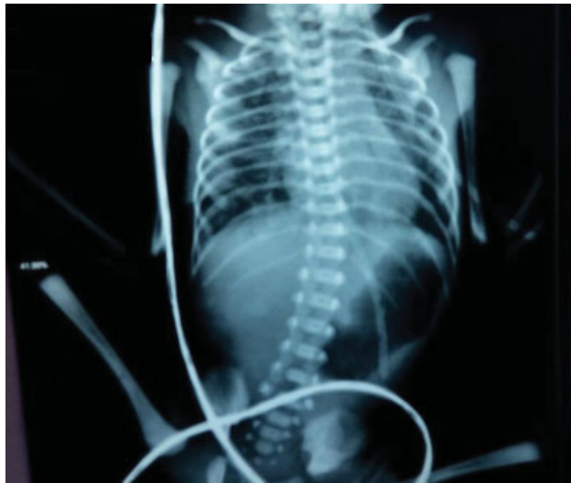
Fig. 1 PXR abdomen standing showing hugely dilated stomach and first part of the duodenum (double bubble sign).