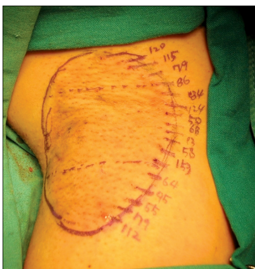
Fig. 1. Left axilla of the patient (size: 10×5 cm, three parts).

Histological examinations were also done on the subcu-