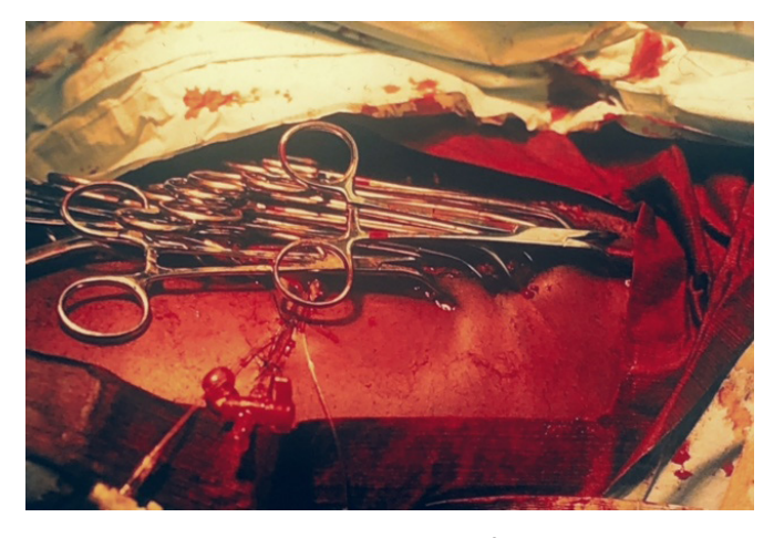
Figure 3 Towel clip closure to cover open left groin wound and shunt except T-piece.

The fundamental principles of 'damage control' for vascular trauma were all applied in this patient.<sup>7</sup> First, bleeding from