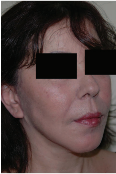
Figure 13. Postoperative views of the same case after 6 months.