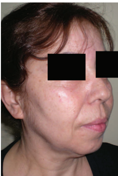
Figure 10. Preoperative view of a 57-year-old-female. Face lifting, neck liposuction, endoscopic eyebrow lifting, lower and upper blepharoplasty with levator plication, and sliding genioplasty were carried out. Deep nasolabial and marionette lines were improved with fat injections.

We observed that an additional chin operation did not prolong the recovery period significantly, which was a main concern in some cases. Tapes were applied around the chin postoperatively