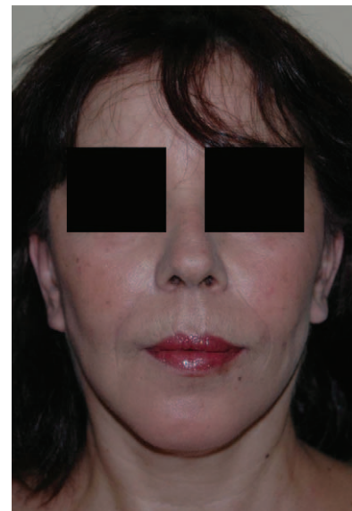
Figure 12. Postoperative views of the same case after 6 months.