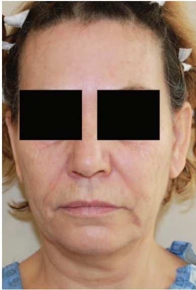
Figure 5. Preoperative view of a 55-year-old-female. Face-neck lifting and upper blepharoplasty were carried out. SMAS grafts are used to treat the glabellar and infraorbital depressions and tear trough deformity. The nasolabial folds were treated with fat injections. Upper lip shortening and dermabrasion as well as lip augmentation with SMAS grafts were also performed.

and the other with temporalis fascia) demanded removal of the grafts within the first month after surgery. Both showed symptoms of depression and were managed with assurance. After the first month, they both changed their minds, with relief of depression symptoms.