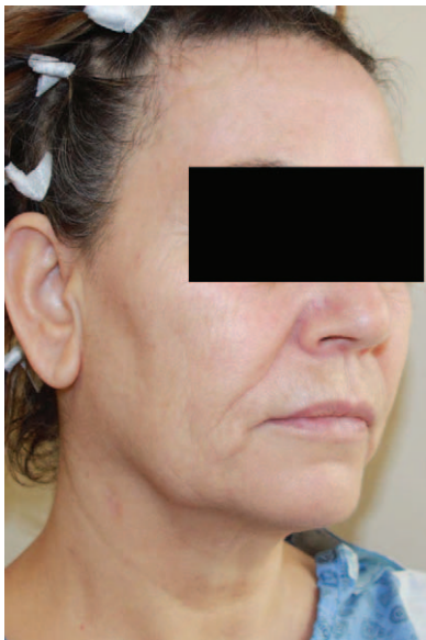
Figure 6. Preoperative view of a 55-year-old-female. Face-neck lifting and upper blepharoplasty were carried out. SMAS grafts are used to treat the glabellar and infraorbital depressions and tear trough deformity. The nasolabial folds were treated with fat injections. Upper lip shortening and dermabrasion as well as lip augmentation with SMAS grafts were also performed.

Upper eyelid cyst formation on the scar line was observed in 1 case (0.52% of upper blepharoplasty cases). The cyst was