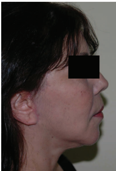
Figure 14. Postoperative views of the same case after 6 months.

The main limitation of our study was the difficulty of the assessment of the satisfaction rate. As our operations were as combined interventions, some patients were very satisfied with