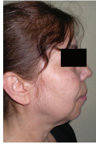
Figure 11. Preoperative view of a 57-year-old-female. Face lifting, neck liposuction, endoscopic eyebrow lifting, lower and upper blepharoplasty with levator plication, and sliding genioplasty were carried out. Deep nasolabial and marionette lines were improved with fat injections.

revision attempts in 1 case (0.49%). One case (0.83%) with glabellar irregularity after endoscopic intervention was managed successfully with fat injection.