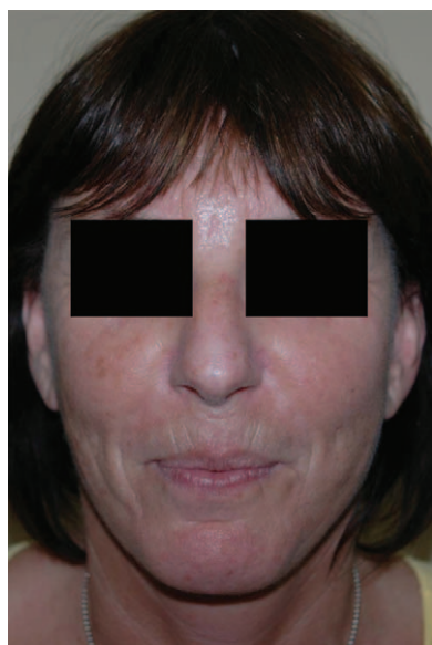
Figure 17. Postoperative views of the same case after 2 months. Note that almost 180 degrees of neck angle became 90 degrees without submental open intervention. Upper dermabrasion was not requested before the operation but would have been very beneficial.

one part of the operation, but not with another part. All of the genioplasty patients were satisfied with the improved chin-neck contours; however, some blepharoplasty patients demanded revisions, as stated before. However, only 12 patients (5.91%) were dissatisfied with the overall results.