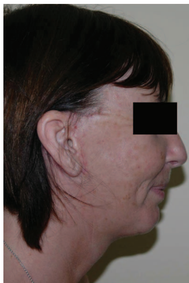
Figure 18. Postoperative views of the same case after 2 months. Note that almost 180 degrees of neck angle became 90 degrees without submental open intervention. Upper dermabrasion was not requested before the operation but would have been very beneficial.

Kaye [19] preferred to perform ancillary procedures during a separate session owing to the increased operating time required. We often completed the face lift and ancillary procedures in the same sitting and completed most of the procedures in our study