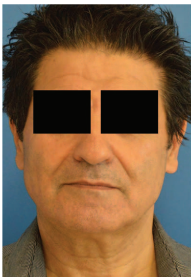
Figure 1. Preoperative views of a 50-year-old-male. Face-neck lifting, upper blepharoplasty, and open-endoscopic combined forehead lifting were performed. Excised SMAS and platysmal tissues were used as autografts to fill the deep transverse and vertical creases of the forehead.