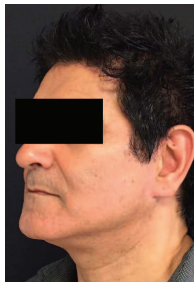
Figure 4. Postoperative views of the same case after 2 years.