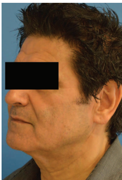
Figure 2. Preoperative views of a 50-year-old-male. Face-neck lifting, upper blepharoplasty, and open-endoscopic combined forehead lifting were performed. Excised SMAS and platysmal tissues were used as autografts to fill the deep transverse and vertical creases of the forehead.

Although 1 case had prolonged drainage from multiple points after fat injection (4% of fat injection cases), we observed no infection or drainage in cases with SMAS-platysma-fascia grafting. Interestingly, 2 lip augmentation cases (one with SMAS