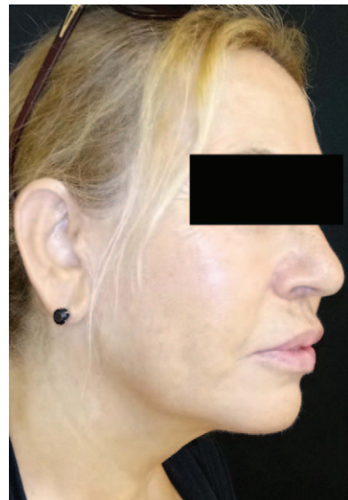
Figure 8. Postoperative views of the same case after a year.

Skin sloughing was seen in 5 cases (2.46% of all cases). All were managed with wound care. Four cases underwent revision under local anesthesia after 6 months, and 1 did not demand revision. Other abnormalities included hypertrophic scars in 2 (0.99%) cases as well as recurrent widespread scarring despite