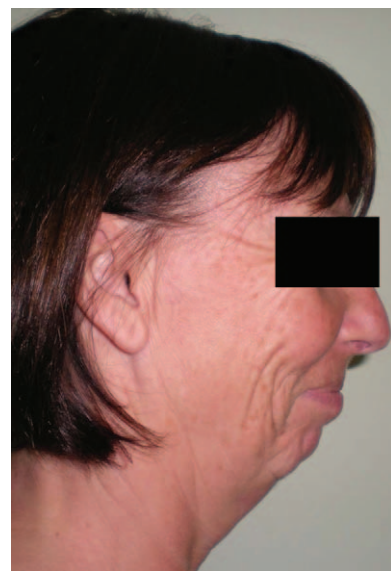
Figure 16. Preoperative view of a 54-year-old-female. Face lifting,neck liposuction, endoscopic eyebrow lifting, lower and upper blepharoplasty, and sliding genioplasty were carried out.