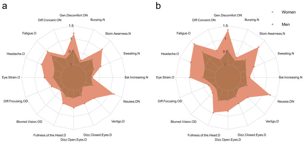
Fig. 2. Mean scores observed in each item of the simulator sickness questionnaire during experiment 1. (a) Women (red area) and men (green area) item scores reported after the first driving session ( i.e. SSQ1) and (b) after the second driving session ( i.e. SSQ2). The O, D and N letters following the name of each item indicate in which class(es) of symptoms the corresponding item was involved [2]: O corresponds to Oculomotor discomfort, D to Disorientation and N to Nausea.

radar chart view (see Table 1 for original dataset).