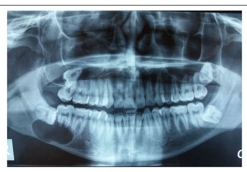
Fig. 1 Panoramic view shows a well-demarcated unilocular radiolucency in right angle of mandible. Impacted 3rd molar tooth is seen superiorly

Follow up was available in 8 out of 10 cases. Follow up periods in these patients ranged from 7 months to 62 months. All 8 patients were treated by enucleation. All 8 patients were alive and well with no recurrences. None of the patients received any additional treatment. (Table 1).