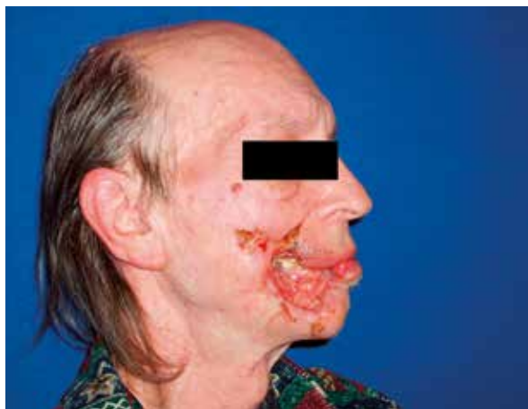
Figure 2. Large, neglected basal cell carcinoma of the facial region

significant weight loss (approximately 15 kg in the past 12 months).