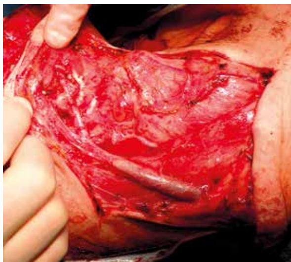
Figure 4. Microvascular anastomosis with facial vessels

The patient was qualified to the surgical treatment (Figures 3 and 4).