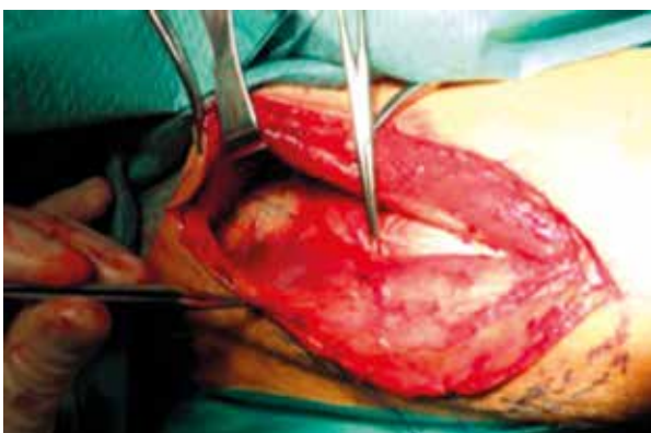
Figure 3. Harvesting of the musculocutaneous anterolateral thigh flap

The computed tomography (CT) scans revealed an extensive tissue loss and the possibility of infiltration of the mandible in the region of the right mental foramen.