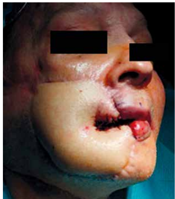
Figure 6. Reconstruction of the mouth

and easy for a skilled surgeon. Large and long pedicle, with a diameter close to potential recipient vessels of the head and neck make the microvascular anastomosis safe and easy. Harvesting ALTf is related with minimal donor site morbidity. The motor weakness is mild and transient,