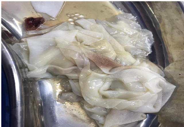
Fig. 2. Ruptured specimen of hydatid cyst of lung.

are often the first signs to appear but they might be missing, especially during severe reactions with immediate state of shock [19]. Epinephrine is the cornerstone and it must be started immediately once the diagnosis of anaphylactic shock is made, other pharmacotherapies are considered: antihistaminic, steroids, and quick fluid replacement [18].