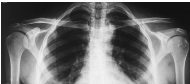
Fig. 2 – Standard stress radiography presenting the acromioclavicular joints in the same image, demonstrating an ACJD V to the left.

Surgery was performed with patient under general anesthesia and brachial plexus block, in a beach chair position. An incision of approximately 2–3 cm (Fig. 3) was made directly on the distal end of the clavicle, which was osteotomized in its distal 0.5 cm and removed together with the meniscus, as described by some authors in specific cases. 12 Anteriorly to the clavicle, the coracoid was digitally identified by palpation, i.e., without direct visualization, the authors would position the anchor insertion guide directly on its superior face. Two double-loaded 2.9-mm anchors (Juggerknot-Biomet) were used in all cases. Four bone tunnels were created in the clavicle using a 2-mm drill, 2 cm from the end of the clavicle; tunnels were square-shaped, with 1 cm between them. Two