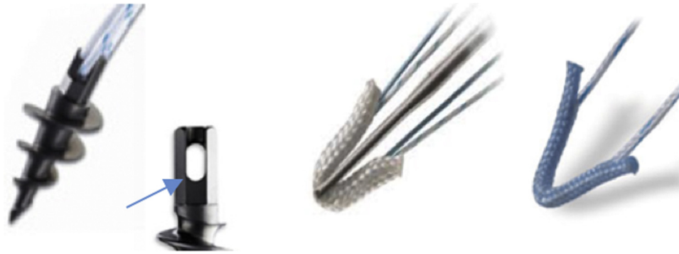
Fig. 1 – Difference between anchors with eyelet (arrow) and without eyelet.

surgeon at a single center between September 2012 and February 2015, were retrospectively reviewed. Age, gender, side, and ACJD classification distribution is shown in Table 1. The study included patients with shoulder trauma who had ACJD grades III or V, and who were operated in up to 30 days from the time of injury. In addition to conventional radiographs (AP, scapula profile, and axillary profile), all radiographs for diagnosis were made in the orthostatic position, with a weight of 2.5 kg on each limb, featuring both acromioclavicular joints in same image (Fig. 2). The minimum follow-up time was set as six months. The exclusion criteria in the selection of patients comprised cases of ACJD grade IV, cases associated with fractures at other sites of the shoulder girdle, and cases that were operated 30 days after injury date.