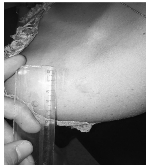
Fig. 3 – Postoperative aspect.

The results of the scores of different groups were analyzed in SPSS (IBM) using the Kruskal–Wallis test, which is similar in methodology to the Mann–Whitney, but allows for the assessment of more than two groups simultaneously. Surgical time and radiographic measurements, which were discrete variables with normal distribution, were analyzed by Student's t-test, compared in pairs, using Excel. For all tests, a confidence interval of 95% was calculated and p -values <0.05 were