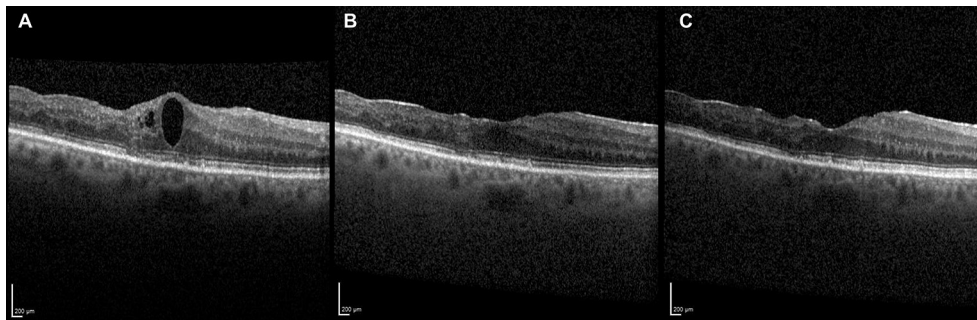
Figure 2 A 75-year-old woman with radiation maculopathy recalcitrant to high-dose intravitreal bevacizumab was treated with adjunctive intravitreal triamcinolone acetate. Resolution of macular oedema as demonstrated by optical coherence tomography at the time of initiation (A) was sustained after 12 months (B) and 18 months (C) of follow-up.