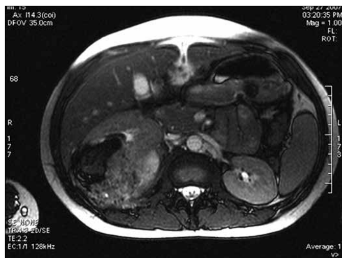
Figure 2. MRI of abdomen, axial T2-weighted MR image (TR/TE, 4,3/2.2) shows 9 cm mass in upper pole of right kidney. The different signal of tumor and signs of bleeding product and smooth muscle/fat.

The whole tumor has been excised within macroscopic healthy borders. The mother's postoperative course was uneventful. Histopathology revealed angiomyolipoma.