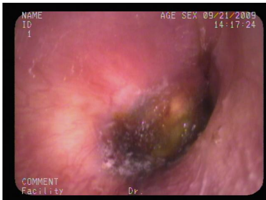
Figure 1 Eschar, a slightly raised erythema surrounding a black necrotic center, in right external auditory canal, centered at 6 o'clock.

Scrub typhus, a mite-transmitted zoonosis caused by the intracellular Gram-negative bacteria, Orientia tsutsugamushi (previously known as Rickettsia tsutsugamushi ), is a disease distributed throughout the Asia Pacific rim and endemic in South Korea, China, Japan, Taiwan, Pakistan, India, Thailand, Malaysia and northern Australia. It is an acute febrile illness characterized by a typical necrotic primary lesion (eschar), generalized lymphadenopathy, maculopapular skin rash, and nonspecific symptoms and signs such as fever, chills, headache, alerted sensorium, seizure, sorethroat, otalgia, cough, dyspnea, vomiting, abdominal pain, jaundice, diarrhea, hepatosplenomegaly, abnormal bleeding, arthralgia and myalgia [1-12]. Unfortunately the typical eschar and skin rash are found on examination in 46%~92% of cases in Korea and less than 10% of cases in Thailand [4,12]. Serious complications, including encephalitis, meningitis, pericarditis, myocarditis, cardiac arrhythmia,