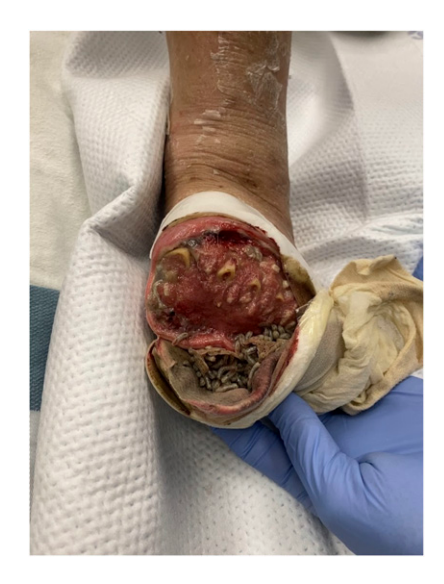
Figure 3—Image taken during telehealthguided removal of maggots after 3 days of maggot debridement therapy in case 3. This patient had previously undergone a transmetatarsal amputation and received maggot debridement therapy at home rather than in the clinic or operating room.

underlying osteomyelitis (1,16). However, as those with diabetic neuropathy have lost "the gift of pain" (2,15), they may attend the ER with a high fever (pyrexia) and fail to mention a foot ulcer, and a careful foot exam may not occur. Indeed, a previous report described one such patient who was investigated for a fever of unknown origin for several days before the correct diagnosis was made (17). At present, all patients with a fever attending the ER are likely to undergo screening for COVID-19, including those with possible osteomyelitis, with the risk of them being exposed to others with