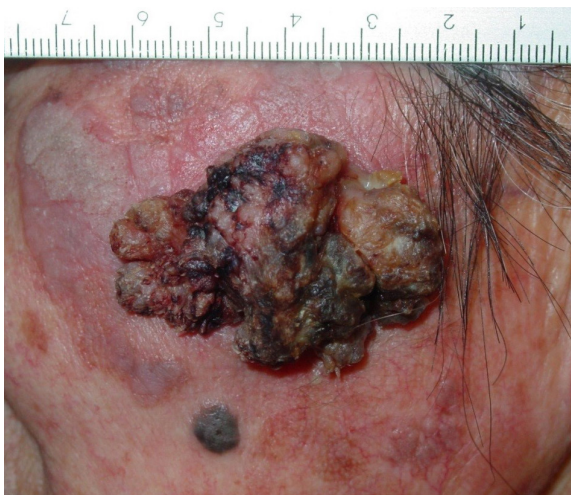
Fig. 1. Preoperative photograph of a 91-year-old woman with a protruding mass on the left zygomatic area.