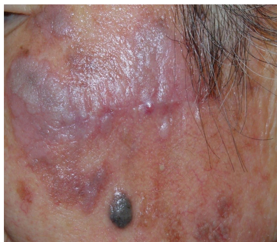
Fig. 4. Postoperative photograph 4 weeks after excision with remaining actinic keratosis.

AK (mass size at biopsy: 4 × 3 cm) of the same site by punch biopsy approximately 12 years previously but had declined additional treatment after biopsy. A high probability of skin cancer was suspected; therefore, excision of the mass and surrounding AK was recommended. However, the patient refused extensive surgery and only wanted “removal of the protruding mass.” An excisional biopsy of the main mass was performed under local anesthesia. The mass was excised with a minimum of 0.4 cm from gross margins with the result of free from tumor of all margins by frozen section, allowing for primary closure after skin undermining. Basal resection was performed in the preplatysmal plane. The histology showed verrucous epidermal proliferation with marked hyperkeratosis (Fig. 2), and lack of nuclear atypia and stromal infiltration consistent with VC (Fig 3). All surgical margins were free of cancer. Evidence for HPV