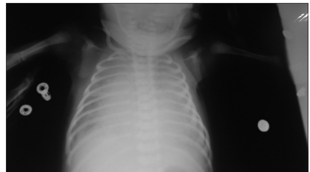
Figure 1: Chest X-ray showing bilateral pleural effusion

The authors certify that they have obtained all appropriate patient consent forms. In the form the