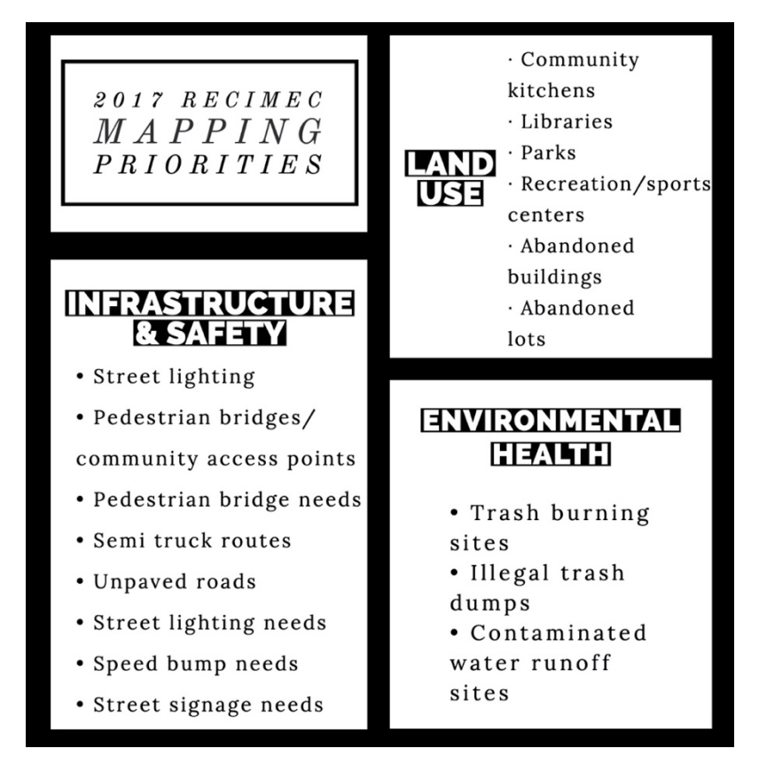
Figure 4. 2017 Red de Ciudadanos por el Mejoramiento de las Comunidades (RECIMEC) mapping priorities.

can benefit public safety. The environmental health risks, reflected in Figure 4, are also related to infrastructure issues such as the irregular garbage pickup in this region of the city. Residents also identified the lack of social services and abundant abandoned lots as impactful to their health and well-being.