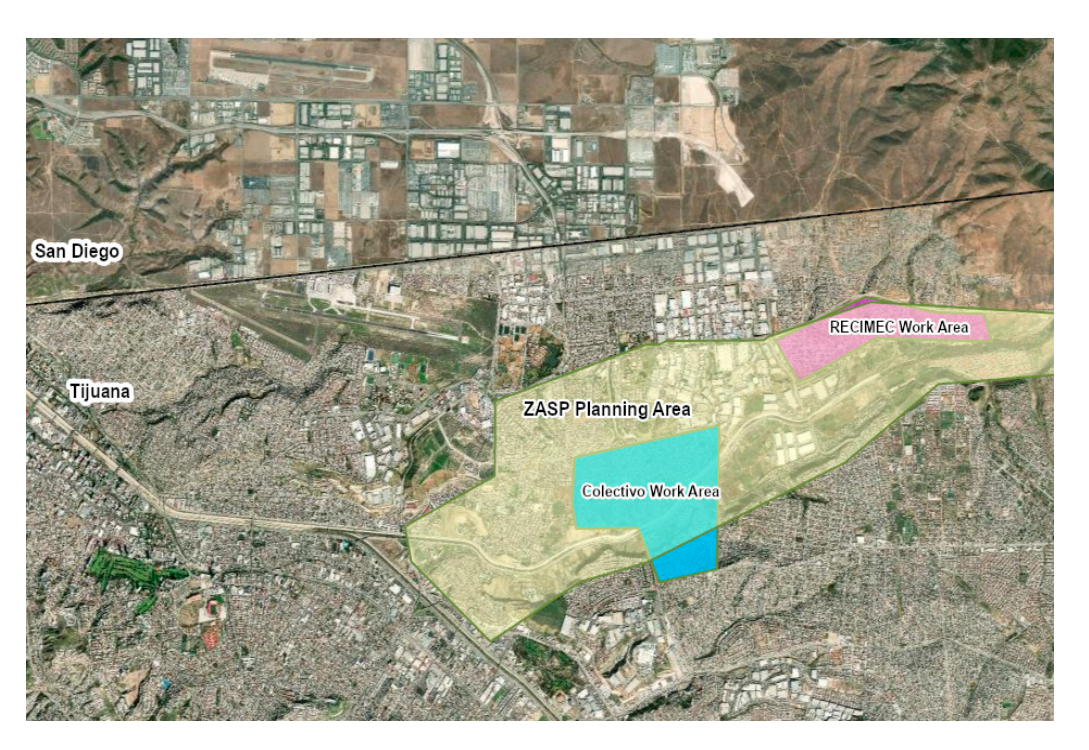
Figure 1. Zona Alamar Specific Plan (ZASP) Planning Area and Organization Work Areas.

This paper outlines the key areas of this mapping project through an analysis of three key research questions. First, what are the key environmental risks and goods in the Zona Alamar? The second research question seeks to evaluate the influence of the community mapping project on the planning process for the ZASP. Finally, what are the mapping project's impacts on community organizing capacity in the Colectivo and RECIMEC? The following sections outline the relevant literature, and methods used to identify priorities and collect data for the community mapping project. Then, project's findings and implications are presented.