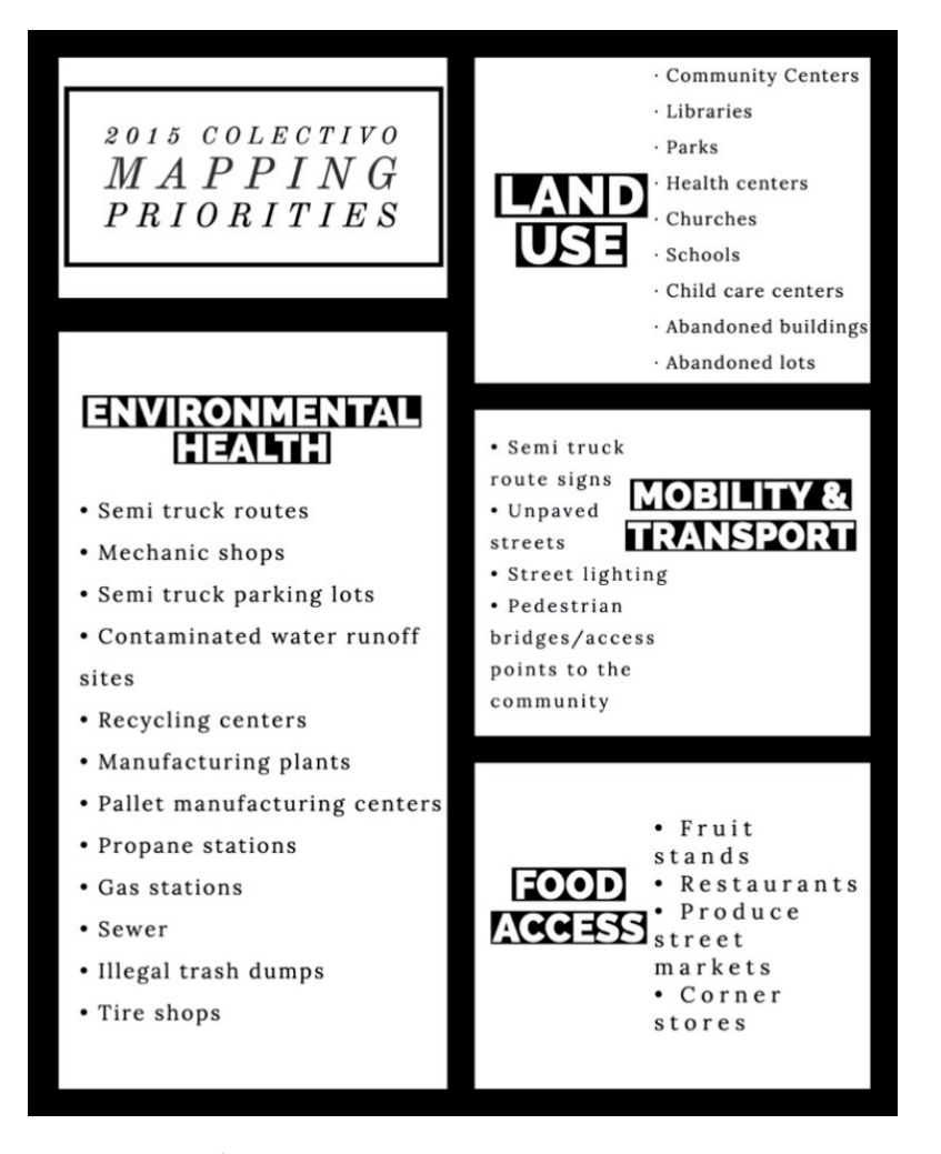
Figure 3. 2015 Colectivo mapping priorities.

The Colectivo's work area is a region of the city that hosts a great deal of industrial activity. Therefore, the biggest area of concern for this community was the impact that manufacturing plants and their related activities have on their community. As seen in Figure 3, key issues include services that support semi-truck traffic like parking lots, pallet manufacturing centers, and mechanic shops. Moreover, recycling centers, manufacturing plants, and contaminated water runoff sites were critical issues as well.