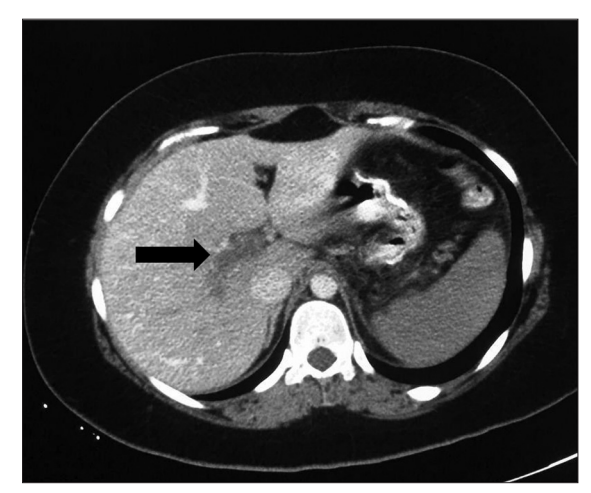
Figure 1. CT scan of abdomen of a 23- year old female showing evidence of portal vein thrombosis (arrow).

travenous fluid along with a therapeutic heparin infusion targeting an APTT ratio of 1.5–2.5, along with ICU supportive care measures. She was started on piperacellin/tazobacam and tegacyclin. Three days later, exploratory laparotomy revealed small bowel ischemia 30 cm from the duodenojejunal junction, thick mottled mesentery and 500 cc of hemorrhagic fluid. We did a resection of the ischemic segment and side-to-side anastomosis. Her condition showed initial improvement because her white cell count normalized, and she was weaned from a mechanical ventilator. On day 10 following the initial laparotomy, she became acidotic and hypotensive and was thus explored again; there was extension of her bowel ischemia and another set of resection anastomosis was performed. Three days after the second opera-