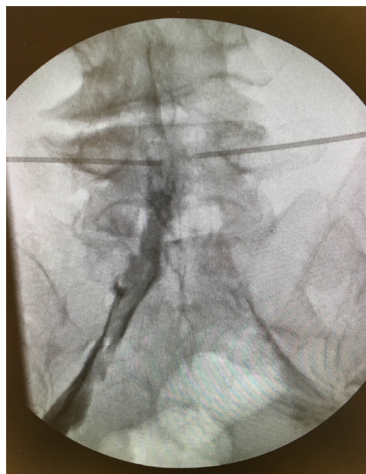
Figure 2 Anteroposterior fluoroscopic image of contrast injected through the second epidural catheter which was placed on the left side of the epidural space showing spread only to the left-sided nerve roots.

roots (Figure 2). To achieve contrast spread bilaterally, injection through both epidural catheters was required. The placement of two epidural catheters was therefore performed in order to avoid the anticipated poor bilateral spread of infused local anesthetic and subsequent inadequate pain relief. The