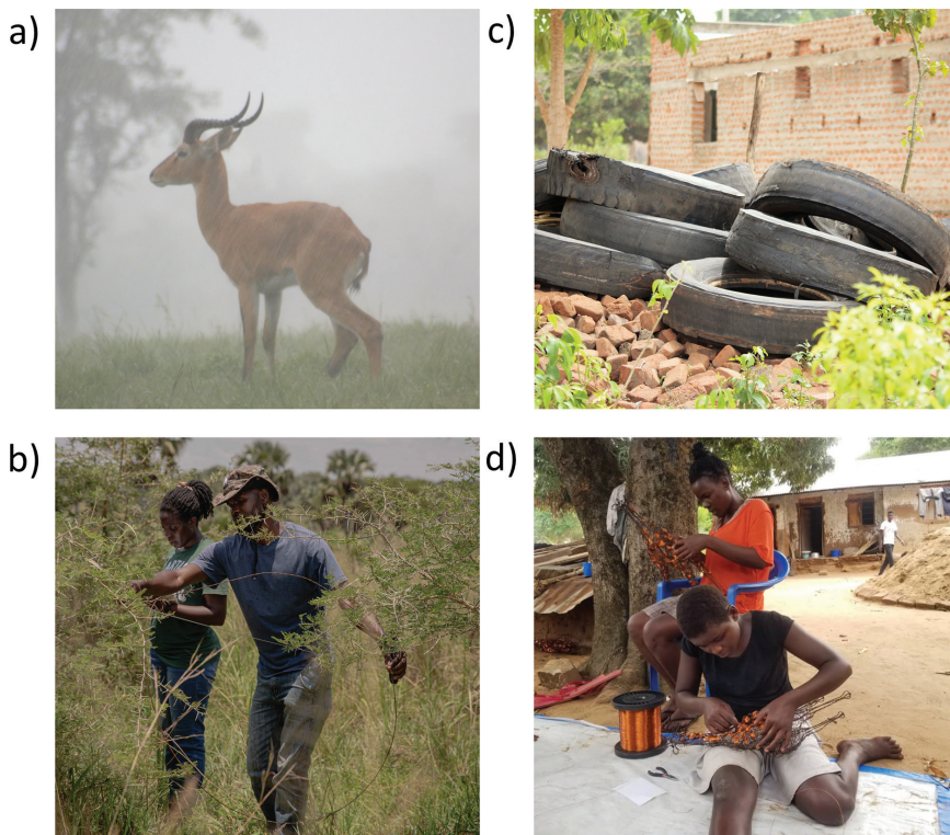
Figure 1. The Snares to Wares Initiative is an intervention designed to conserve biodiversity by uplifting local human communities in conservation. In Murchison Falls National Park, Uganda subsistence poaching not only represents a conservation problem, but also an entrenched social justice issue. The Uganda kob (Kobus kob) is one of the primary targets of subsistence poachers (a). Peter Luhonda and Sophia Jingo removing wire snares from the national park (b). The wires used by subsistence poachers in this region often derive from radial vehicle tires (c). The local artisans of the Snares to Wares Initiative produce bespoke pieces representing animals that are subjected to poaching pressure (d).

us to evaluate the students' perspectives of biodiversity conservation versus social justice and how those valuations changed over the semester.