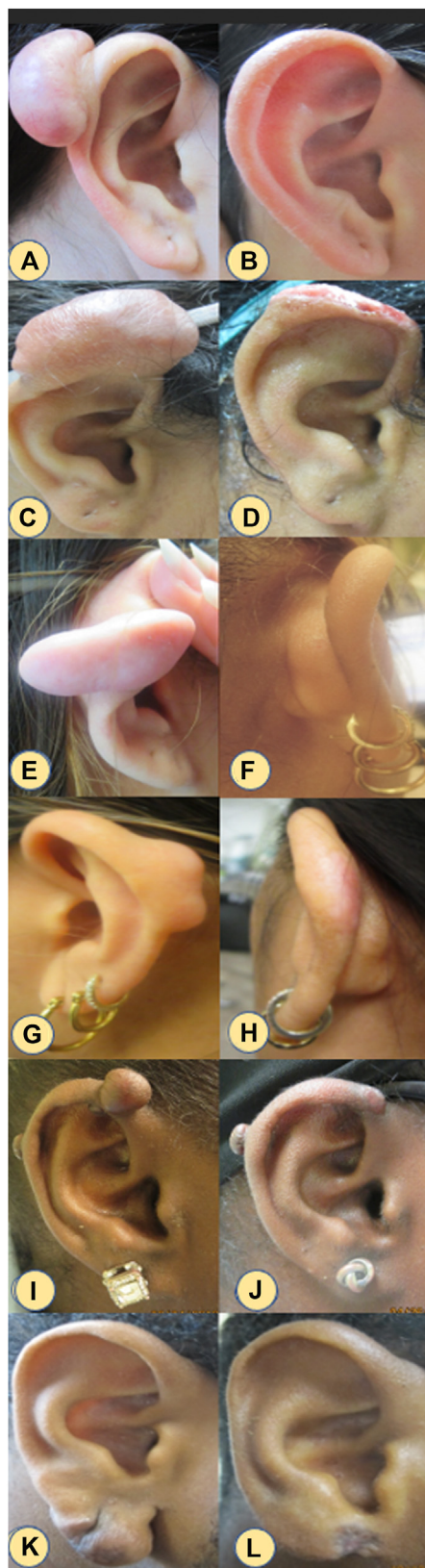
Fig 2. Case 2 to 6. Preexcision (A, C, E, G, I, K) and postexcision after complete wound healing (B, D, F, H, J, L).

do treatment regimens differ between trials, but treatment durations, which can range from 4 to 24 weeks, are also not standardized. With large discrepancies in treatment periods from other studies, our study was designed specifically to define an efficacious treatment protocol and clinical application for auricular keloid recurrence prevention.