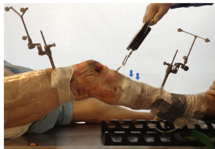
Figure 3. Setting of a cadaveric investigation using non-invasive inertial sensor (blue arrows).