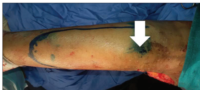
Figure 3: Marking of perforator plus flap design showing anterior tibial artery perforator located through hand-held Doppler device (white arrow)