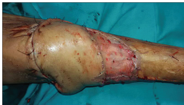
Figure 5: Immediate postoperative picture showing defect coverage with flap and split-thickness skin graft