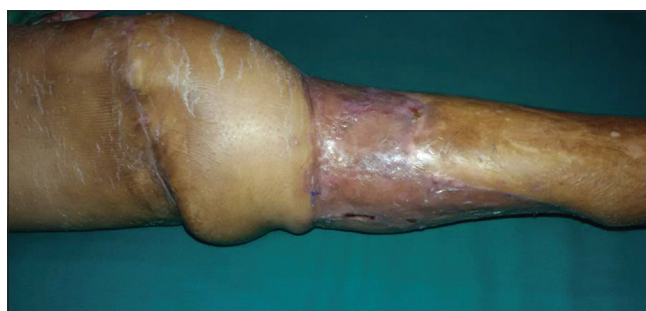
Figure 6: Clinical picture showing healed flap with full knee extension

The role of nursing in oncology practice is enormous, and it achieves very significant importance in the surgical field. The oncology trained nursing staffs help in achieving a wide exposure of surgical area and good blood-free field. To prevent spasm of perforator, constant irrigation of saline and lignocaine is achieved with help of nursing personnel. The postoperative management of flap and its contour is checked round the clock with help of the assistance of staff personnel and play an important role in constant monitoring of the flap.