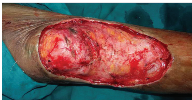
Figure 2: Defect of size 18 cm \times 8 cm following tumor excision

Primary flap reconstructions after bone and soft tissue tumor surgery are often performed in for various reasons. Reconstruction methods allow a complete tumor excision with adequate margins. Flap coverage around the knee joint provides vascularized tissue for covering the defect and improves healing. It provides durability to newly introduced coverage as well as ability to bear the breakdown from the