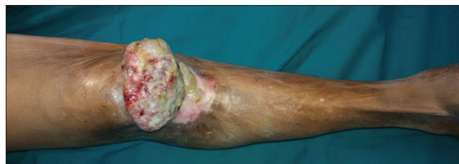
Figure 1: Clinical picture of fungating tumor over right knee joint

All the patients were operated on under spinal anesthesia. An approximate size of the defect was assessed of the expected deficit of skin cover after considering adequate margins depending on the type and size of the tumor [Figure 1]. The perforator was located on the lateral aspect of the leg using a hand-held Doppler. In the case no. 1, it was an intraoperative decision to do the perforator plus flap after we realized that the gastrocnemius muscle was too small to cover the defect. After the defect is created by the oncosurgeon [Figure 2], the horizontal length of the expected defect was marked in a vertical direction along the length of the flap using the location of the perforator as a fulcrum for flap transposition. Planning in reverse was done in all the cases. Then, we applied the tourniquet without exsanguinating the limb. The fasciocutaneous flap was then raised after marking from distal to proximal until the selected perforator was reached using loupe magnification [Figures 3 and 4]. Marking of perforator plus flap design showing anterior tibial artery perforator located through hand-held Doppler device and elevated flap with perforator [Figures 3 and 4]. Additional perforators encountered during elevation of the flap were ligated. The dissection was done down till the deep fascia which too was incorporated in the flap, and