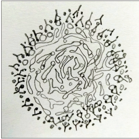
Figure 3: Hand-drawn illustration of the mechanism of Splendore–Hoepli phenomenon representing fungal hyphae surrounded deposition of antigen–antibody complexes, glycoprotein and debris from host inflammatory cells

amorphous material of varied sizes with parallel clefts and often these crystals have a brownish hue and are double refractile in polarized light. [3]