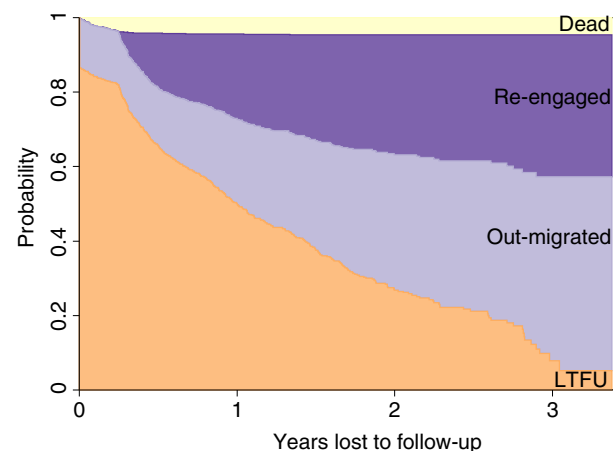
Figure 3 Patient outcomes after LTFU ascertained through record linkage between clinic records and AHDSS, Agincourt (2014–2017). [Colour figure can be viewed at wileyonlinelibrary.com ]

treatment at another health facility and 2.2% continued care at two facilities in the AHDSS area. The cumulative incidence of transferring to another facility in the study site was 3.2% (95% CI 2.2–4.4%) at 1 year and 14.4% (95% CI 10.8–18.6%) at year 3.