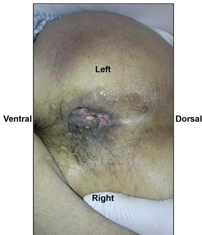
Fig. 1. Visual examination of the anus: a solid mass of a thumb tip size with an uneven indented surface located mainly in the left side of the anus was observed.