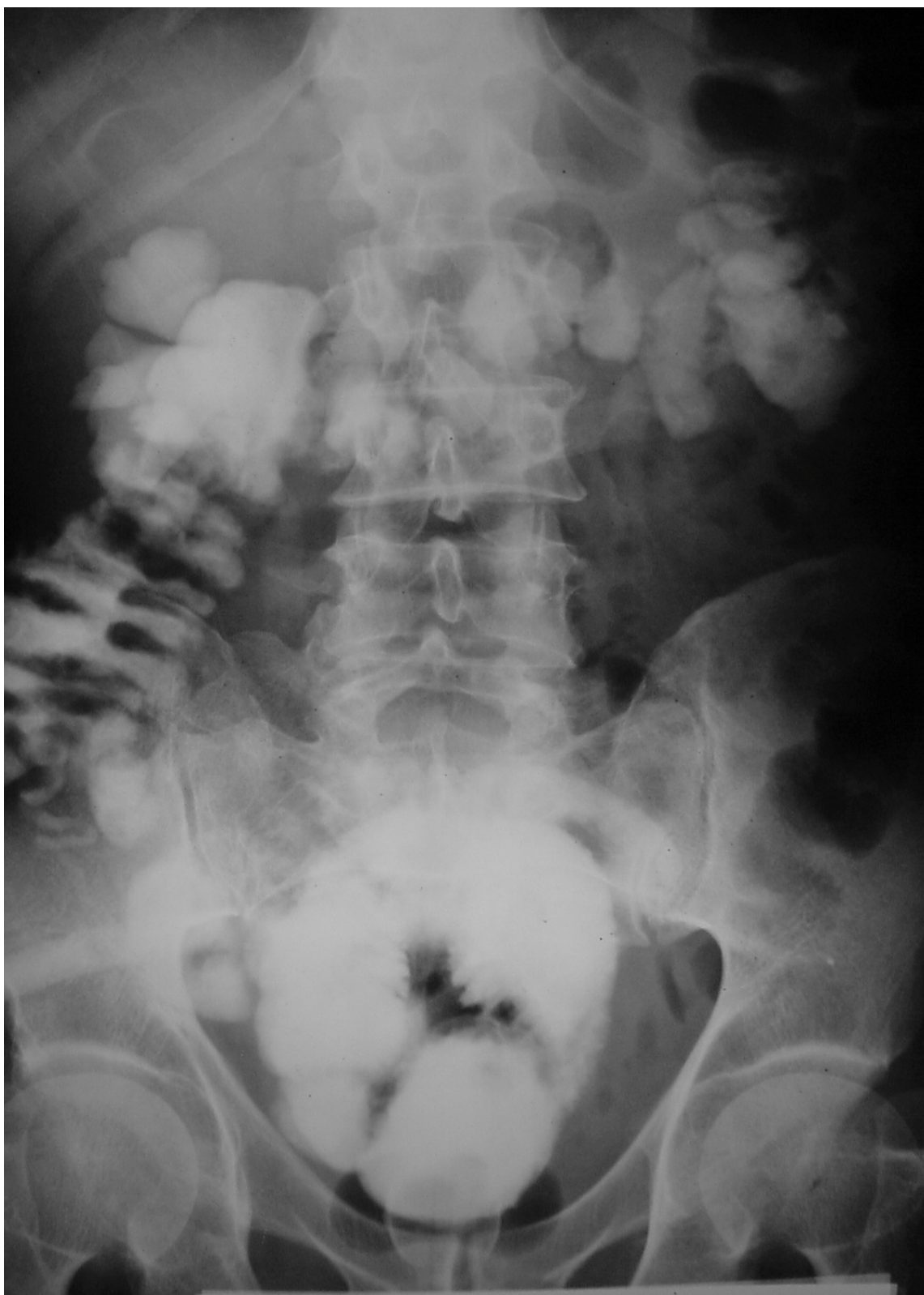
Figure 2 Pouchogram of the patient with entero-pouch fistula.