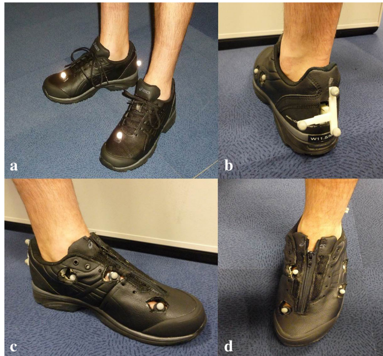
Fig. 1 a Plug-in-Gait HEE and TOE markers in the intact shoe marker set, (b) posterior view of our Plug-in-Gait plus modified-OFM cut shoe showing the rearfoot wand, (c) medial view of the foot model and shoe, and (d) superior view of our foot model showing the zip