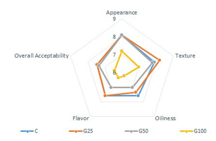
Fig. 1. Sensory properties of chicken patties.

One of the limiting factors for fat reducing strategies is sensory properties due to the functions of fat in meat products. The results of sensory analysis are shown in Fig. 1. In general terms, the scores awarded by the panelists were similar in all the treatments except G100. Replacing all of the beef fat with GE showed negative impact on all investigated sensory characteristics of chicken patties and G100 samples received the lowest scores. Flavor parameter could be affected by the existince of beef fat. Even the beef fat was reduced to half, it gave characteristic flavor to the samples. Negative effects of replacing 100% of the animal fat with GE on sensory characteristics have been reported in other researches (Pintado et al. , 2015a, Pintado et al. , 2016).