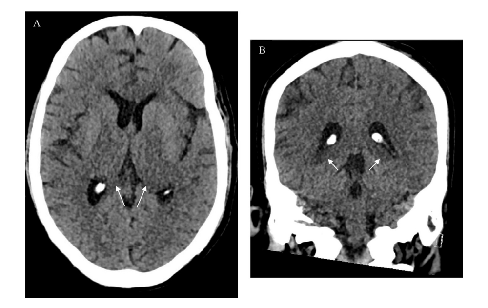
Fig. 2 - CT head axial (A) and coronal images (B), showing hypodensity of bilateral thalami (arrows).

Fig. 1 – HRCT scan axial (A) and coronal images (B), showing bilateral scattered peripheral groundglass opacities with areas of consolidation.