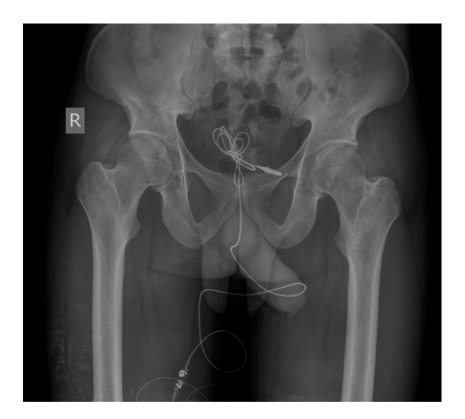
Figure 2 Pelvic X-ray depicting radio-opaque foreign body within bladder.

psychological disorders. Accidental, iatrogenic foreign bodies, migration from surrounding organs and penetrating injuries can occur very rarely [3,4].