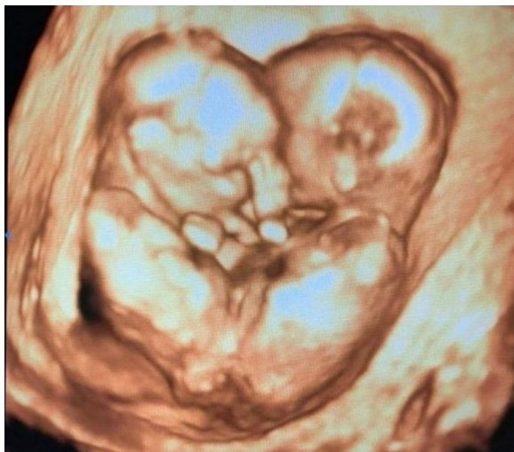
Fig. 1 – Conjoined twins viewed on 3D prenatal ultrasound.

tracts, and the genitourinary system is often doubled in these types of twins [4]. Ischiopagus twins can be further classified depending on the number of legs that develop, as tetrapus (four), tripus (three), or bipus (two), among which tetrapus twins are the most common [2]. The first separation of ischiopagus tetrapus conjoined twins was reported in 1966 by Eades and Thomas [4]; since then, a few cases have been reported around the world, with only one case reported in Vietnam. We present our experience with the preoperative evaluation, surgical planning, and postoperative treatment of a pair of female ischiopagus tetrapus conjoined twins who were separated at the City Children's Hospital in Vietnam.