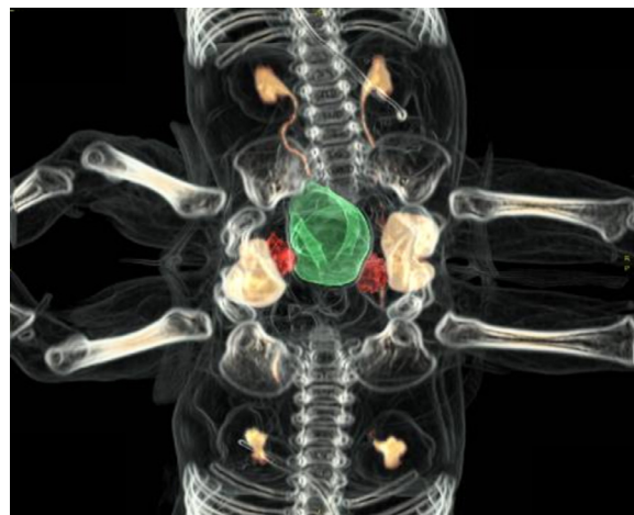
Fig. 3 – CT view of the ischiopagus conjoined twins (the rectum was green, the bladders was next to the rectum and orange in color).