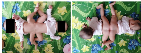
Fig. 2 – Twelve-month-old ischiopagus tetrapus conjoined twins.

The twins were transferred to our intensive care unit when they were 1 day old. Both developed respiratory distress syndrome shortly after birth and were treated with surfactant and mechanical ventilation for four days. Physical examination revealed that both twins were approximately equal in size. Twin 1 had an imperforate anus, a duplicated vagina, and an external urethral orifice. Twin 2 had an anus, a duplicated vagina, and a urethral opening.