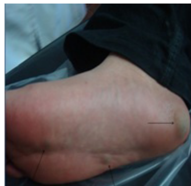
Fig. 1 : Multiple compressible bluish nodules on the patient foot.

Important diseases that involve the skin and gastrointestinal tract with vascular malformations include BRBNS, Mafucci's syndrome and Osler-Weber-Rendu syndrome. However, Rendu-Osler-Weber syndrome is an inherited autosomal dominant condition and these patients often experience