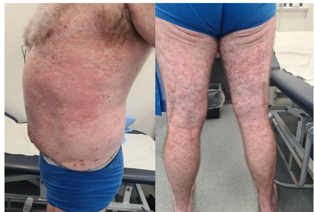
Fig. 1 Morbilliform rash on trunk and lower limbs

there was a mixed chronic inflammatory infiltrate comprising lymphocytes, plasma cells, neutrophils, and numerous eosinophils (Fig. 2). Direct immunofluorescence was negative. He received a tapering dose of oral prednisolone (initially 0.5mg/kg tapering by 5mg per week) in combination with mometasone topically. Despite substantial improvement with this regimen, his rash began to worsen 2 days following discontinuation of oral prednisolone. He was still using daily mometasone on cessation of oral steroids. He was trialled on oral doxycycline for 1 month, which leads to a significant improvement in his morbilliform rash. Despite improvement in the rash, the patient reported ongoing intense daily pruritus which was having a marked impact on his quality of life. Dermatology Quality of Life Index (DLQI) was 24 at this time. As his main issue was pruritus without rash, he was referred for narrowband UVB phototherapy (TL01). He completed 30 sessions of TL01 with 20% 2 increments without complication. His pruritus has now resolved following this course of TL01.