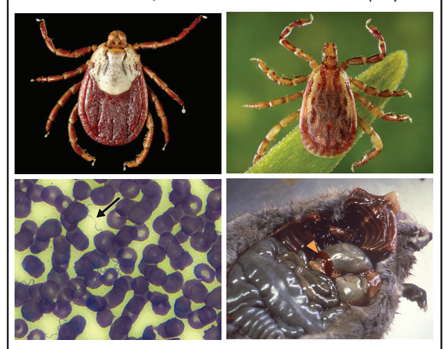
https://wwwnc.cdc.gov/eid/ page/tick-spotlight EMERGING INFECTIOUS DISEASES®

Symptoms of tickborne disease are highly variable, but most include sudden onset of fever, headache, malaise, and sometimes rash. If left untreated, some of these diseases can be rapidly fatal.